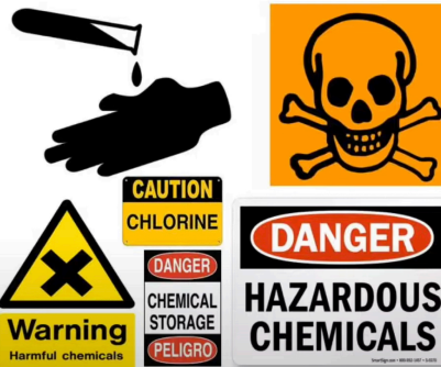
These signs warn of Chemical Hazards

Chemical Hazards are OCCUPATIONAL HAZARDS that exposure to chemicals in the workplace may cause.