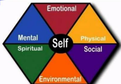
Dimensions of Health